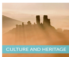
CULTURE AND HERITAGE